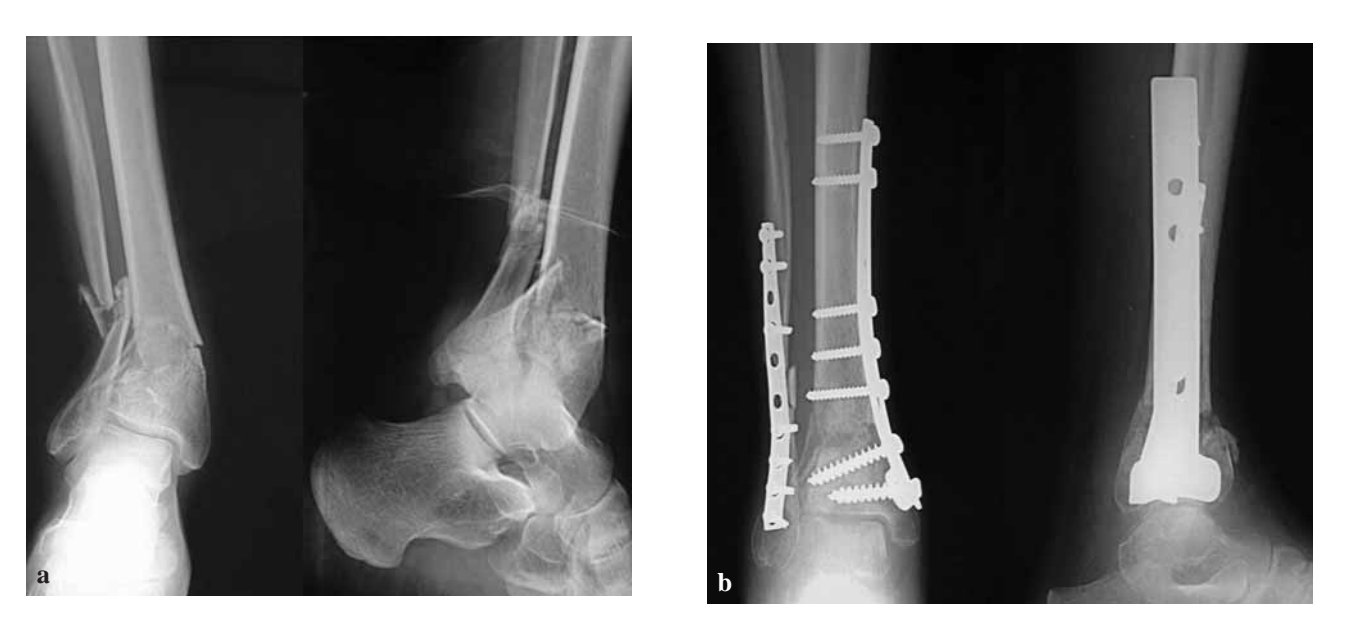
Figs. 4a & b. — Pilon fracture with metaphyseal comminution, treated with ORIF of the fibula and percutaneous plating of the distal tibia using a large fragment T plate.

studies have been published to date, but it is clear that MIPO results in less surgical trauma to the soft tissues (5).