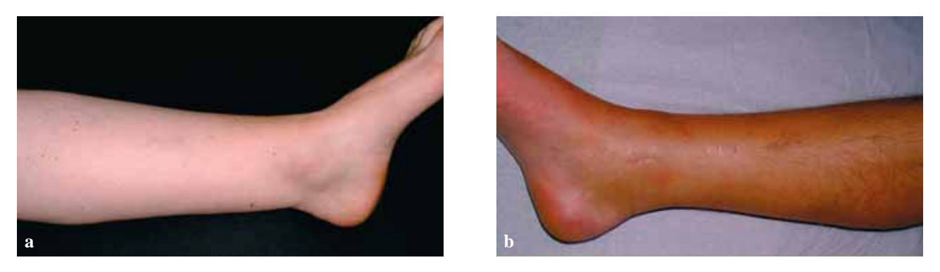
Figs. 2a & b. — Clinical appearance of two treated legs one year postoperatively

with a slight limp. In two patients minor swelling of the ankle region was noted. All ankle joints were mobile within functional limits.