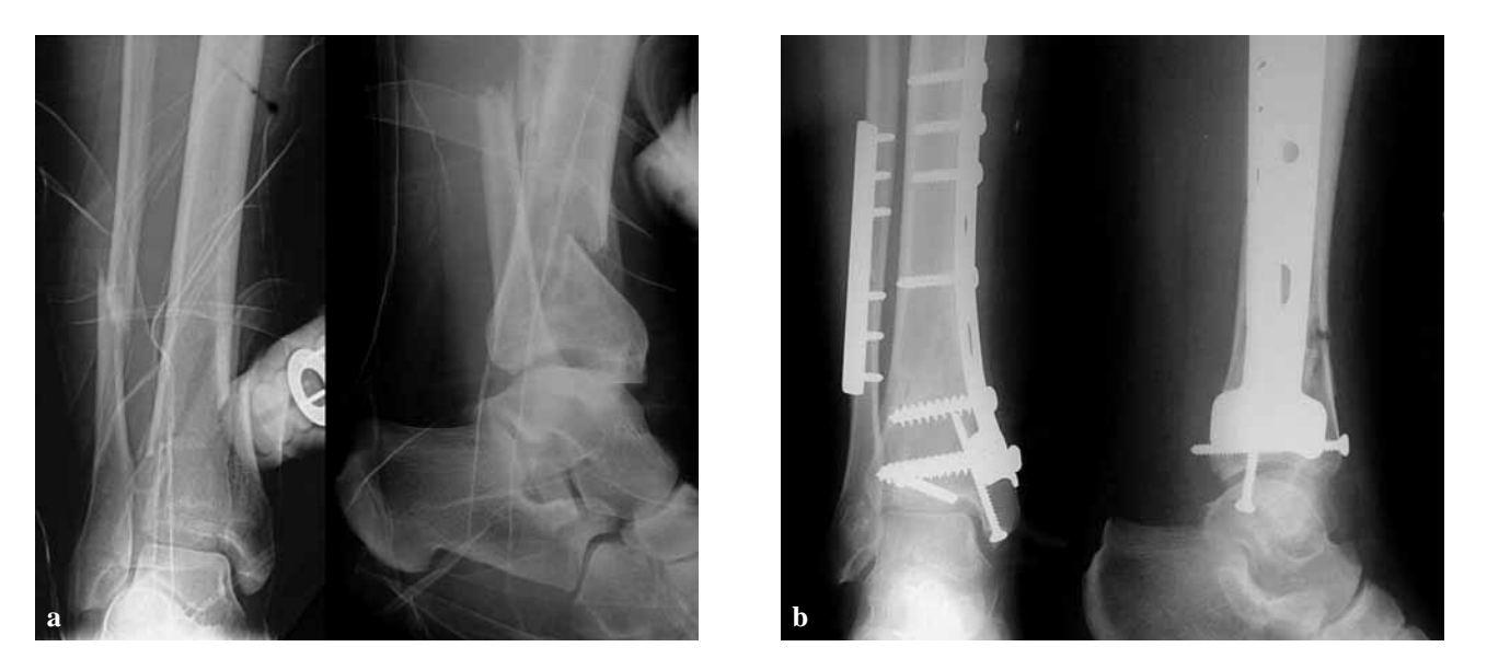
Figs. 3a & b. — Distal tibial fracture extending into the ankle joint ; the articular fragments are fixated percutaneously with cancellous screws and one anteroposterior lag screw.