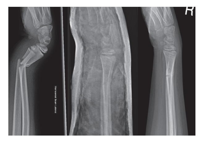
Fig. 1. — Example case of distal radius fracture treated successfully with manipulation under ketamine 1) Initial plain lateral radiograph 2) Lateral radiographs after reduction under sedation 3) Final lateral radiograph at 4 weeks

group (26 patients 74%) than the MUK group (20 patients 61%), although this difference did not reach statistical significance (p=0.39). An example case of distal radius fracture successfully treated with reduction under ketamine is shown in Figure 1. The reduction achieved in two cases in the MUK group was deemed unacceptable by the treating surgeon and these patients required a further manipulation under general anaesthesia. During follow up, no