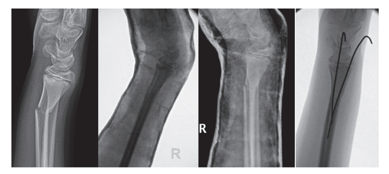
Fig. 2. — Example case of failed manipulation under general anaesthesia; 1) Initial plain lateral radiograph 2) Reduction intraoperatively 3) Redisplacement at 6 days 4) Position after percutaneous Kirschner wires

The mean cast index was higher in the MUK group, 0.81 (CI 0.77-0.85) versus 0.77 (CI 0.73-0.80). The mean gap index was similarly higher in the MUK group, 0.25 (CI 0.23-0.3) versus 0.23 (CI 0.21-0.26). Although the trend was towards improved cast quality under general anaesthesia, neither the difference in cast index (p = 0.14) or gap index (p = 0.21) reached statistical significance as demonstrated in Figure 3. The mean time utilised in theatre for the MUA group was 50.8 minutes (range 26-80) and 31% of these children required overnight admission following the procedure as illustrated in Figure 4.