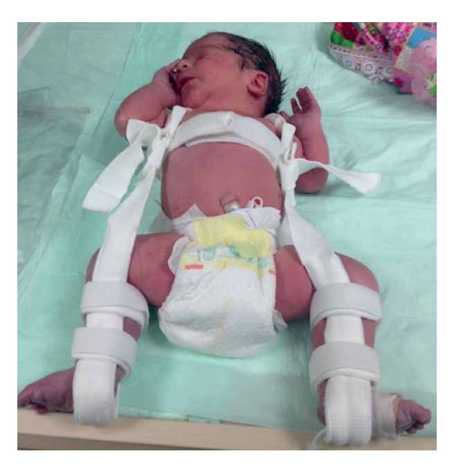
Fig. 1. — Pavlik Harness

Obstetrics and orthopedics clinicians are familiar with birth-related fractures of clavicle with an incidence rate of 1.11% (3). Its mechanism and high incidence rate are understandable due to nature of vaginal birth. Yet, long bone fractures are rarely observed. Basha et al reports a 0.023% incidence rate for long bone fractures during delivery (1).