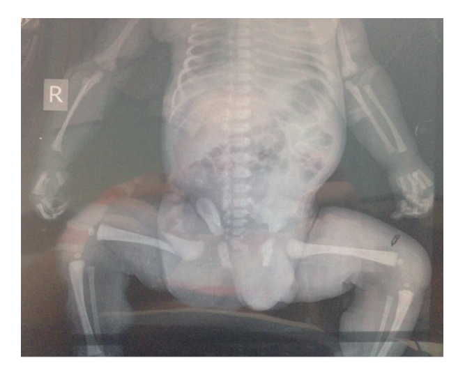
Fig. 3. — Control X-ray of Pavlik harness applied to a femoral subtrochanteric fracture in a neonate.

Femur fractures make up for 0.017% in this rate. Incidence rate of delivery-related femoral fractures varies between 0.0077% and 0.013% in the literature (5,7). Most of these fractures are femoral shaft fractures due to the nature of the injury. Only 2 of the 10 cases in the small series by Kancherla et al are subtrochanteric fractures (4). Our small series of four subtrochanteric fractures is therefore significant and adds to the limited data available on this specific type of injury.