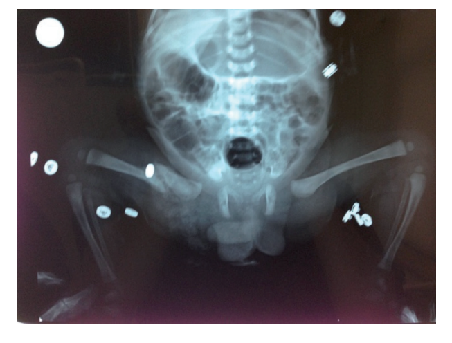
Fig. 4. — Control X-ray at the second week of follow-up.