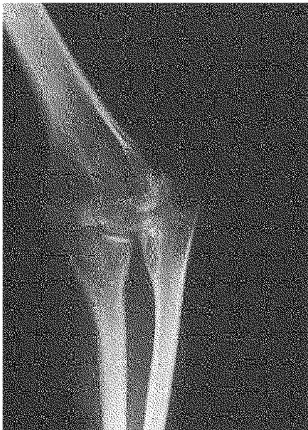
Fig. 2. — Radiograph of the elbow showing duplication of the ulna and absence of the radius.

micronodular cirrhosis with copper deposits in the hepatocytes and mild focal microvacuolar steatosis. At the present visit her liver tests were within normal limits with a copper of 149\mu\text{g}/100\text{ml} ; ceruloplasmin was normal. No esophageal bleeding had occurred since the treatment started in 1993.