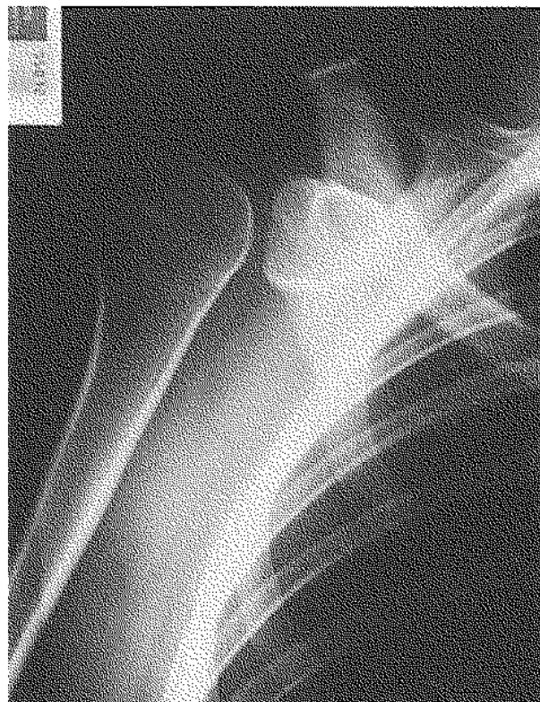
Fig. 3. — Radiograph of the shoulder with deformity of the humeral head and glenohumeral dislocation.

Duplication of the ulna with absence of the radius is known as ulnar dimelia. According to Wood and Green (9) the following features are present: limited elbow flexion, absent or limited pronation, flexion contracture and radial deviation of the wrist, weak finger extension, absent thumb and thumb web, polydactyly, syndactyly and palmar cleft. Only a limited number of cases have been well described and published (2, 3, 4, 5, 6, 9).