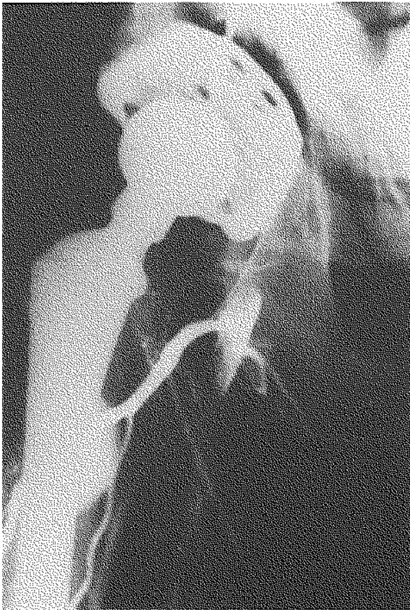
Fig. 3. — New leakage of contrast at the same place.