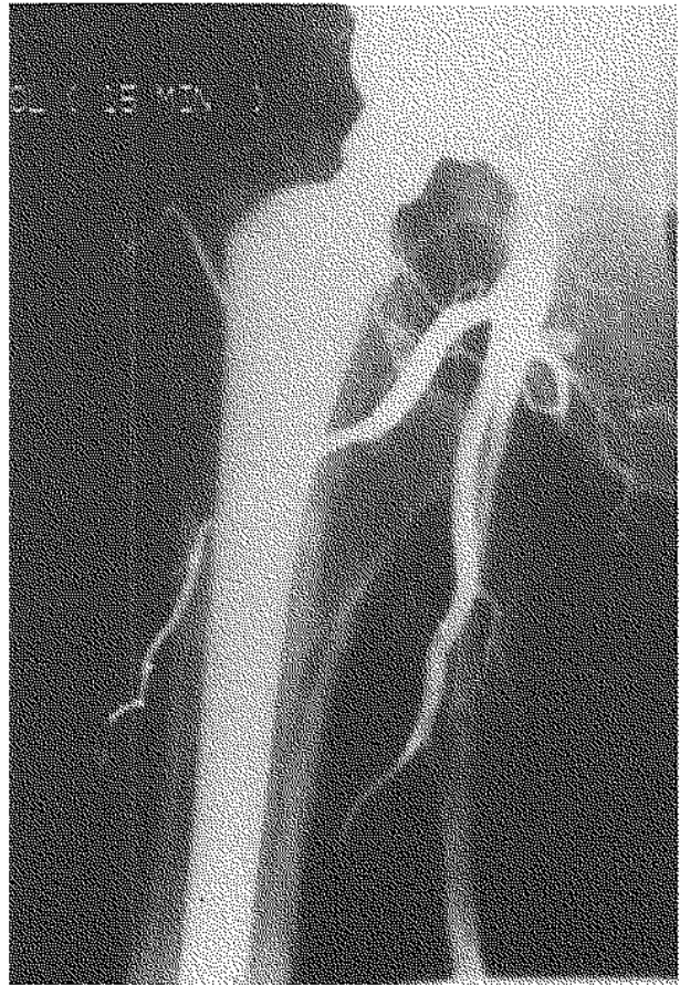
Fig. 4. — New and definitive successful embolization.